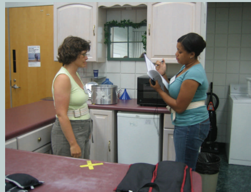
Trainees administering the CS-PFP 10 test at the summer 2008 training workshop.

The next training workshop is set for April 26 and 27th at the University of Georgia. The two-day CS-PFP training workshops are offered two times a year. These workshops include a lecture on the psychometrics validation of the CS-PFP, interactive training, time with seasoned CS-PFP administrators. The workshop brings together individuals from a variety of health care backgrounds currently or planning to assess functional performance. Rich discussions among workshop trainees and the trainers provide insights that go beyond the CS-PFP test. The 1:2 ratio of trainers to trainees enhances the learning experience. Fall and cardiovascular safety are emphasized. Competency exam is administered. More information on costs and how to register can be found on the CS-PFP website.